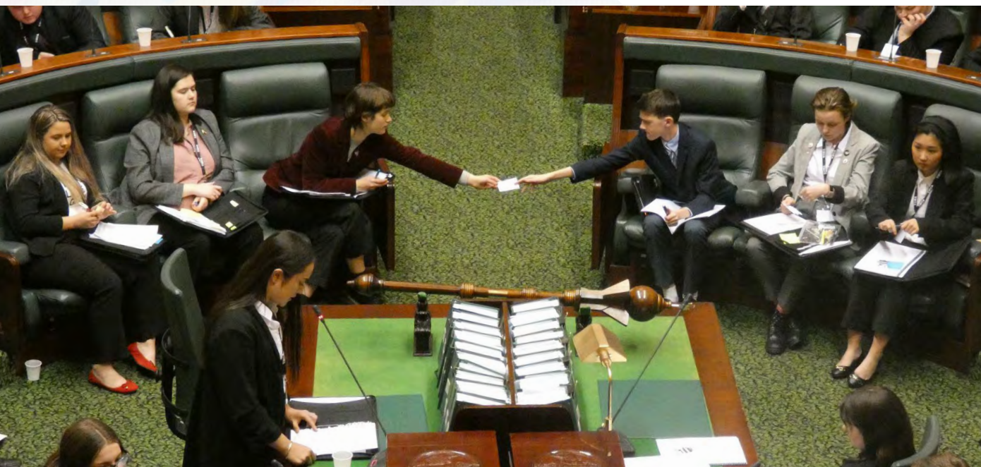
Note passing in the Legislative Assembly during Youth Parliament.

An annual progress summary will be reported in the VEC Annual Report.