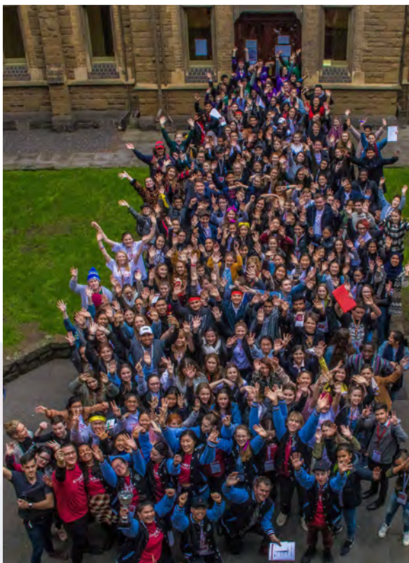
Secondary students at VicSRC Congress 2018.