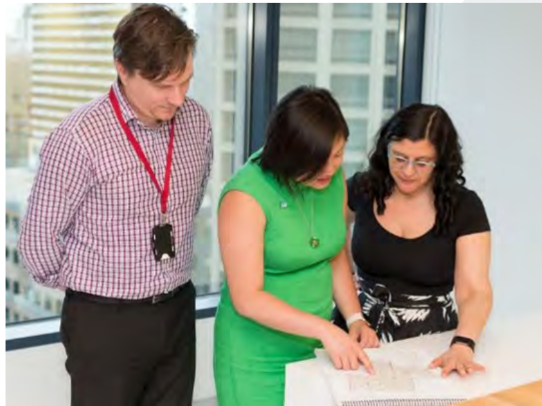
VEC geospatial staff looking over a boundary map.