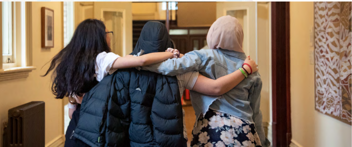
Secondary students at VicSRC Congress 2019 making friends.

The VEC pays respect to ancestors and Elders, past, present and emerging. The VEC is committed to honouring Aboriginal and Torres Strait Islander peoples' unique cultural and spiritual relationships to the land, waters and seas and their rich contribution to society.