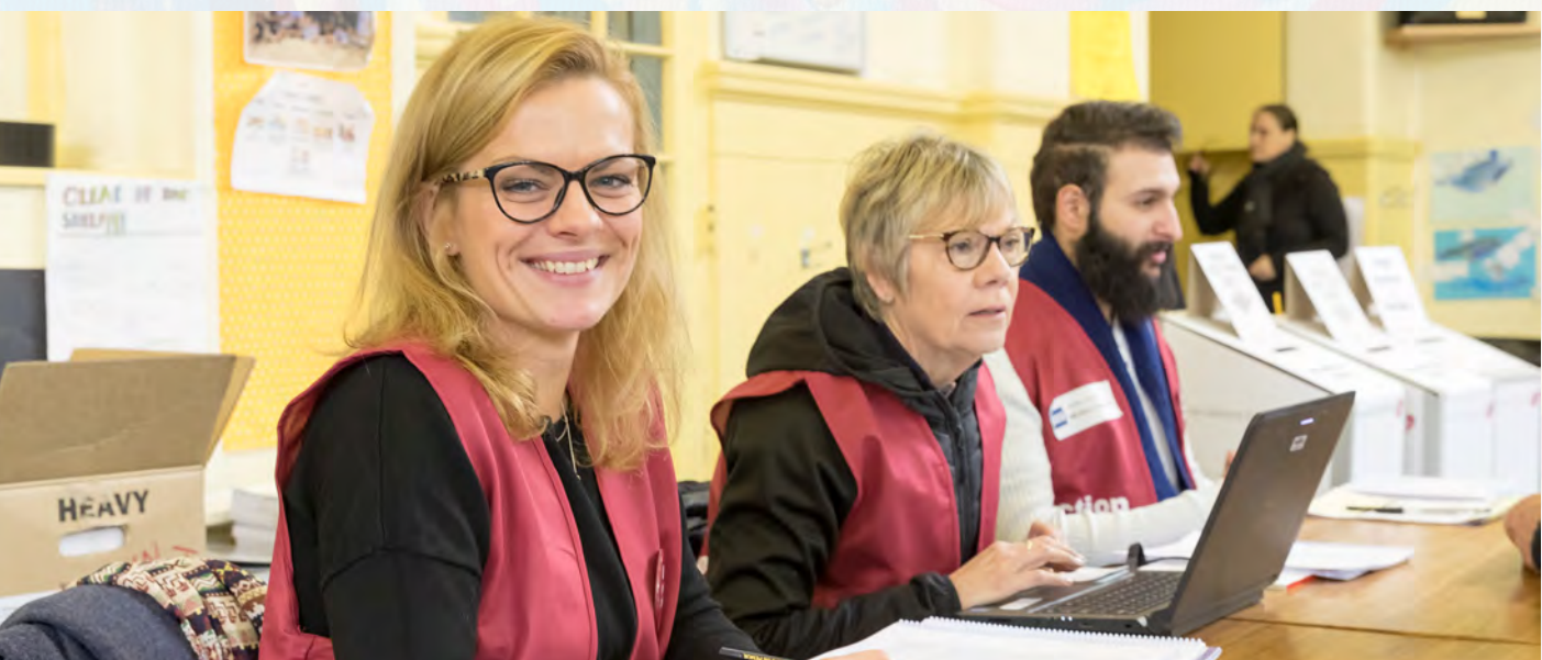
Smiling VEC staff busy at work at the last State election 2018.

However, the VEC is not subject to the direction or control of the Minister in respect to the performance of its responsibilities and functions and the exercise of its power.