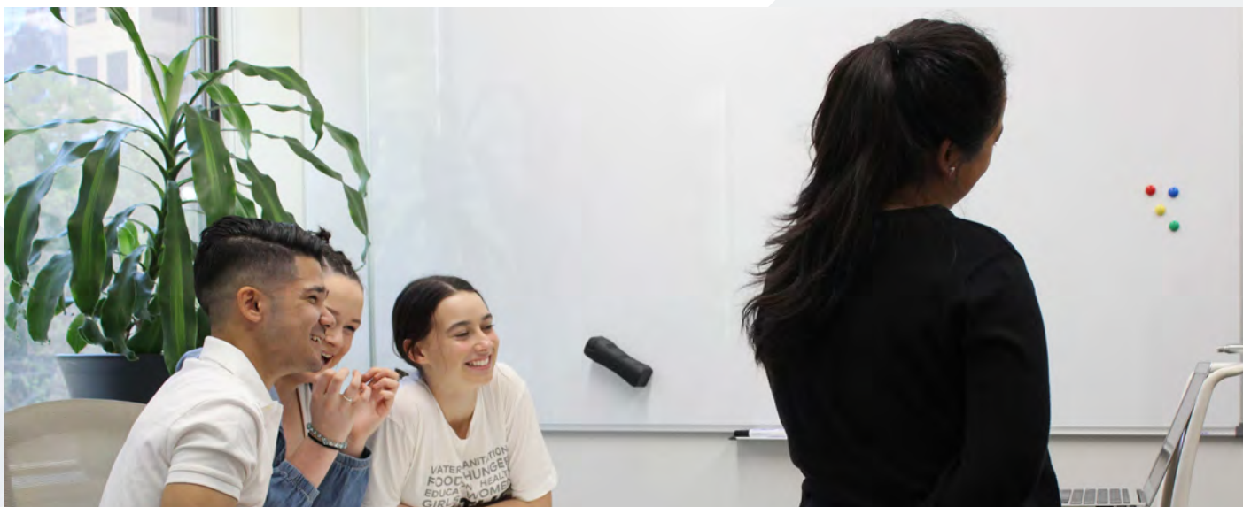
VicSRC Executive Committee students filming a Teach the Teacher webinar.

consultation on the YPIP has ensured it aligns with Strategy 2023 , most particularly in the 'relationships' pillar. The VEC's aim is to learn from others outside the organisation about opportunities and challenges. By seeking advice and knowledge from all networks when planning to improve its services and products, the VEC can remain relevant. It can provide services and products that not only meet customer expectations but where possible, have been co-designed with those very same customers.