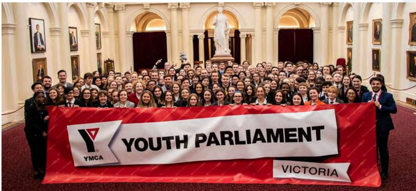
2019 Youth Parliamentarians in Queen's Hall, Parliament of Victoria.