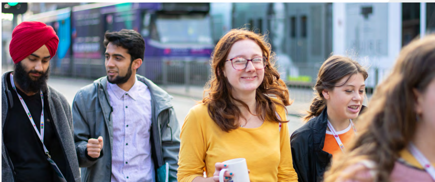
Students at VicSRC Congress 2019 walking to Open Morning to present their solutions to education issues.

The YPIP has been designed following a review of research into young people's electoral engagement and relevant State and Federal government policy impacting young people, namely DHHS's Youth Policy: Building Stronger Youth Engagement in Victoria 3 , and the Australian Government's National Youth Policy Framework (currently under development). Importantly, the Victorian Government is consulting on a Victorian Youth Strategy, due for release in late 2021. Consultations with VEC staff and partner organisations from the youth sector, including the VicSRC, YMCA Victoria and the Department of Premier and Cabinet's Victorian Youth Congress, have also informed the development of the YPIP.